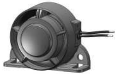
66/68 Series w/Wires