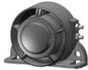
66L/68L Series w/Lugs